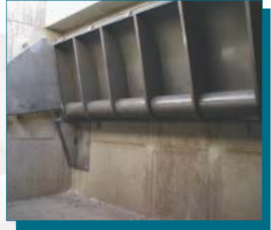
Downstream view of TRU-BEND Overflow Bending Weir

The TRU-BEND overflow bending weir (Type O), is designed to react instantly and will automatically adjust itself in order to constantly maintain the designed overflow water level. The key component of the TRU-BEND is the eccentric control disc. This eccentric control disc is designed to supply a permanent balance of forces between the hydrodynamic pressure of the water (acting on the upstream face of the bending weir) and the counterbalancing weight. Should the additional inflow be greater than the design peak discharge, the TRU-BEND will remain fully open and act as an emergency overflow. The TRU-BEND may be installed in either new or existing overflow structures in order to increase storage capacity. While the TRU-BEND is custom made, it is shipped ready to install. It is simply dropped in place and anchored to the existing concrete structure. The Hydraulic capacity of the TRU-BEND is at least equal to that of a standard overflow weir. This means that the upstream water level is not adversely affected by the presence of the TRU-BEND overflow bending weir type O.