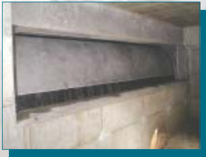
TRU-BEND sealed on all four sides